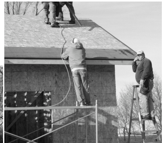
Above: The construction class working on Morgan's garage.

The automotive shop does all kinds of work and is looking for oil changes, tire rotations, leak detection, break inspection, etc. If your vehicle needs to be fixed, send it to the auto shop. If you have questions about what can be fixed in the auto shop, contact Mr. Klemm or any of the kids in auto class.